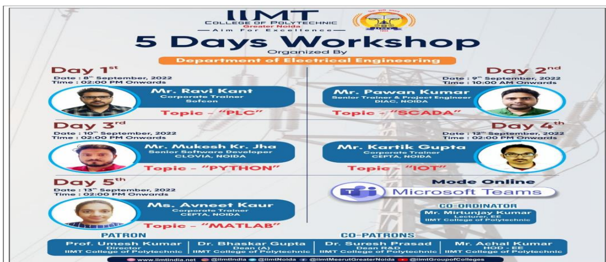
Fig: Creative of the Workshop

5. Ms. Avneet Kaur shared about the basic knowledge and discussed many tools used in Matlab.