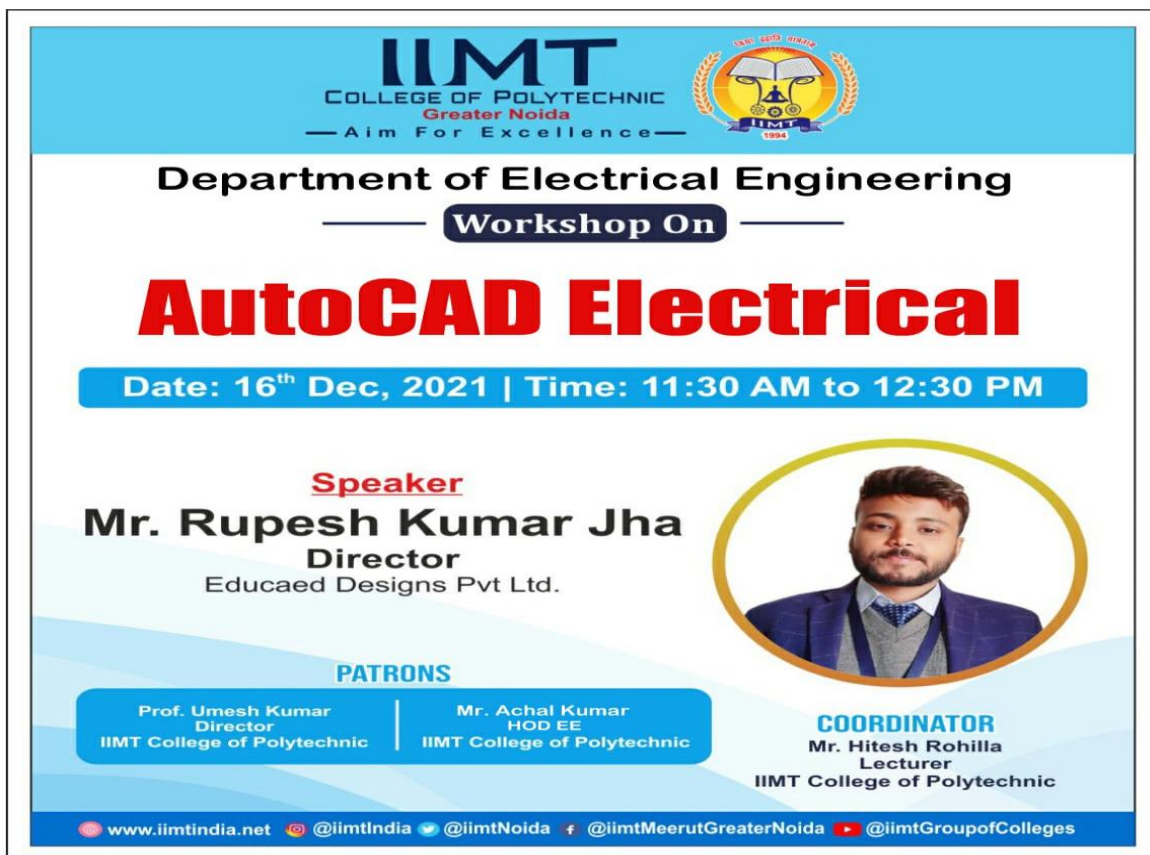
Fig: Creative of the Workshop