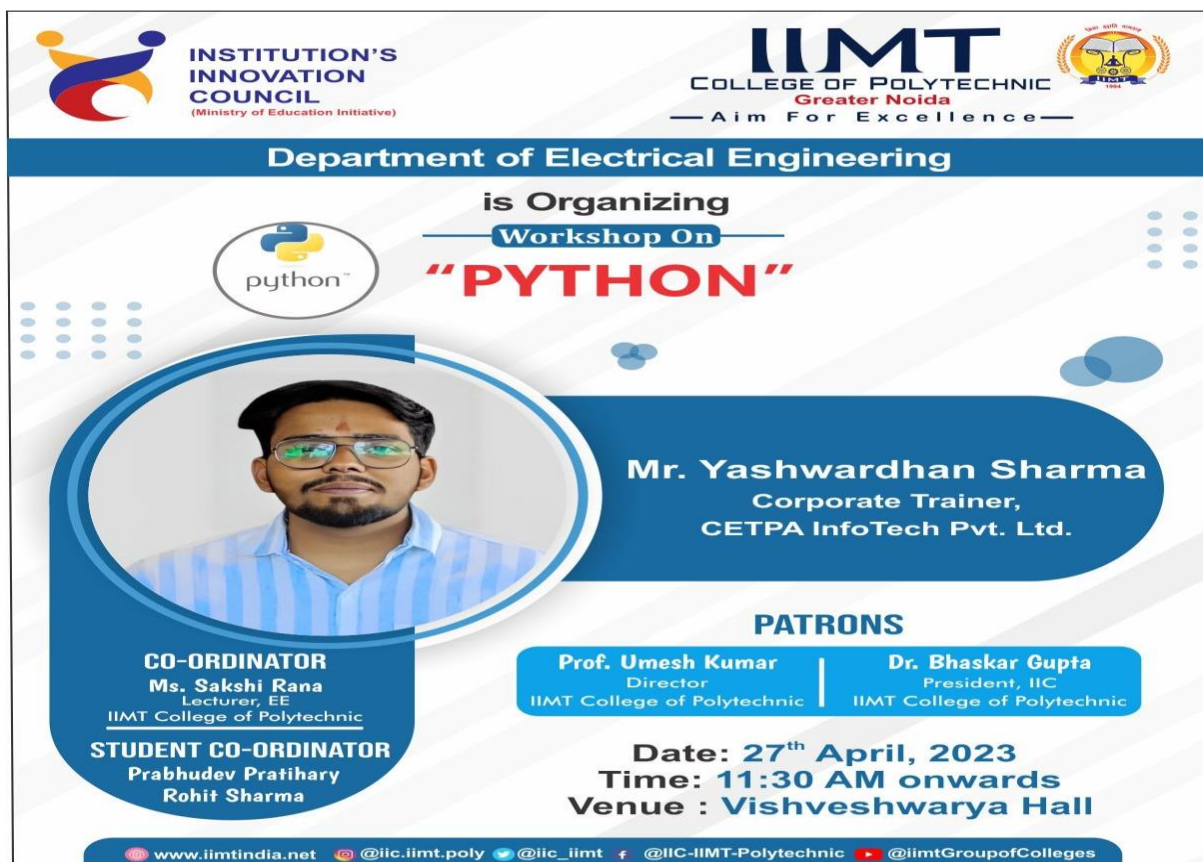
Fig: Creative of the Workshop

He gave a detailed introduction to and discussed its impact in our day- to- day life. The sessions held in the workshop were highly interactive and the participating faculty and students of the institute were greatly benefitted by the knowledge shared by the speaker.