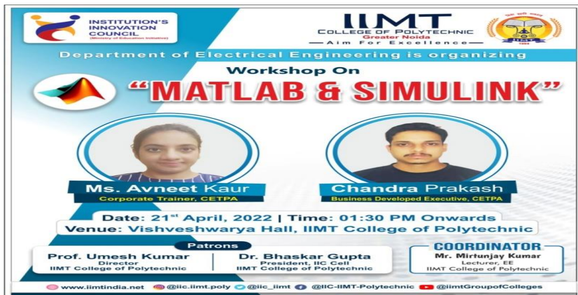
Fig: Creative of the Workshop